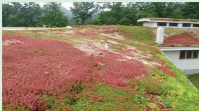
Picture of a sample green roof

Bucks County - 215-345-3400 - www.buckscounty.org Chester Co. - 610-273-3771, x-228 - www.chestercountyswa.org Delaware County - 610-892-9627 - www.delaware.pa.us/recycle Montgomery County - 610-278-3618 - www.wsaemc.org City of Philadelphia - 215-686-5560 - www.phila.gov/streets