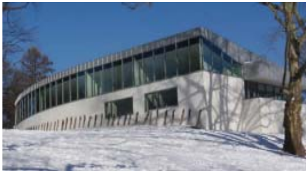
Exterior of the new addition at the Library

Visit the library website at www.tredyffrinlibraries.org for more information about programs and events.